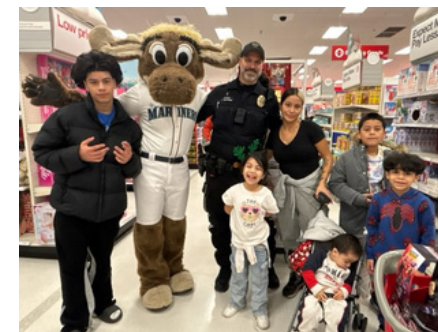
2024 Heroes & Helpers Event

To help the Police Department stay connected to the community it serves, BPF provided funds for community events that serve well over 1,000 people, such as National Night Out, Halloween on the Hill, and Battle of the Badges.